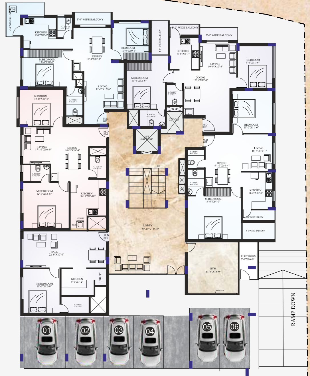
GROUND FLOOR PLAN NO. OF PARKING - 6